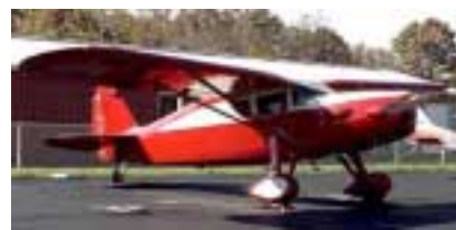
A pair of Fairchild's flew in for the Vinton Co. Pig Roast Oct. 21.

It was a far different scene Oct. 21 at Vinton County as 25 to 30 planes flew in for their annual Pig Roast fund raiser. Though EAA Chapter 1054 had no airshow