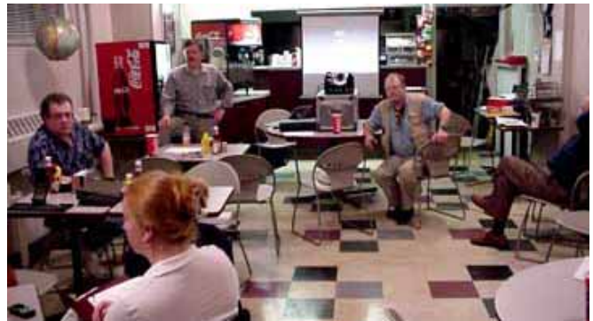
Members of Columbus Flight Watch met Nov. 18 in the Barnstomer Restaurant. They heard about difficulties with the new tower at Port Columbus. Controllers report they have to stand on boxes in order to look over the edge of the tower to observe all runways and taxiways.