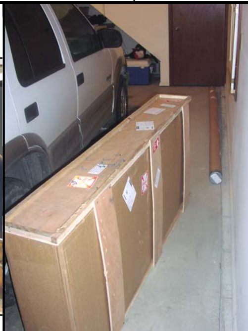
Lots of Boxes to go